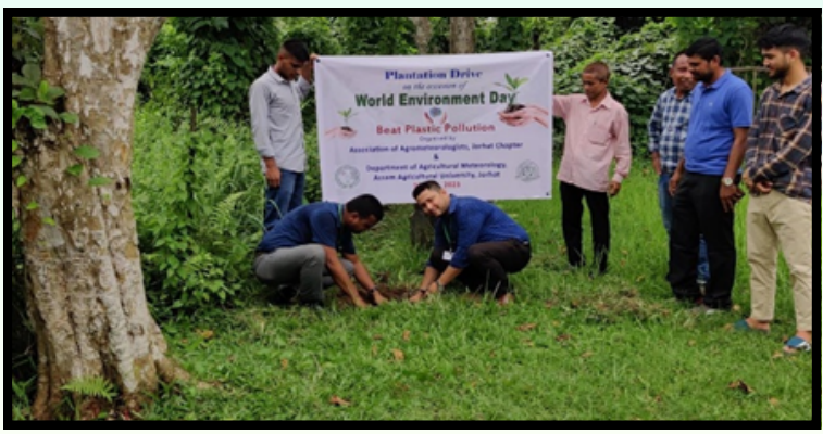
Celebration of World Environment Day at Jorhat