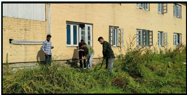
Celebration of World Environment Day at Kashmir